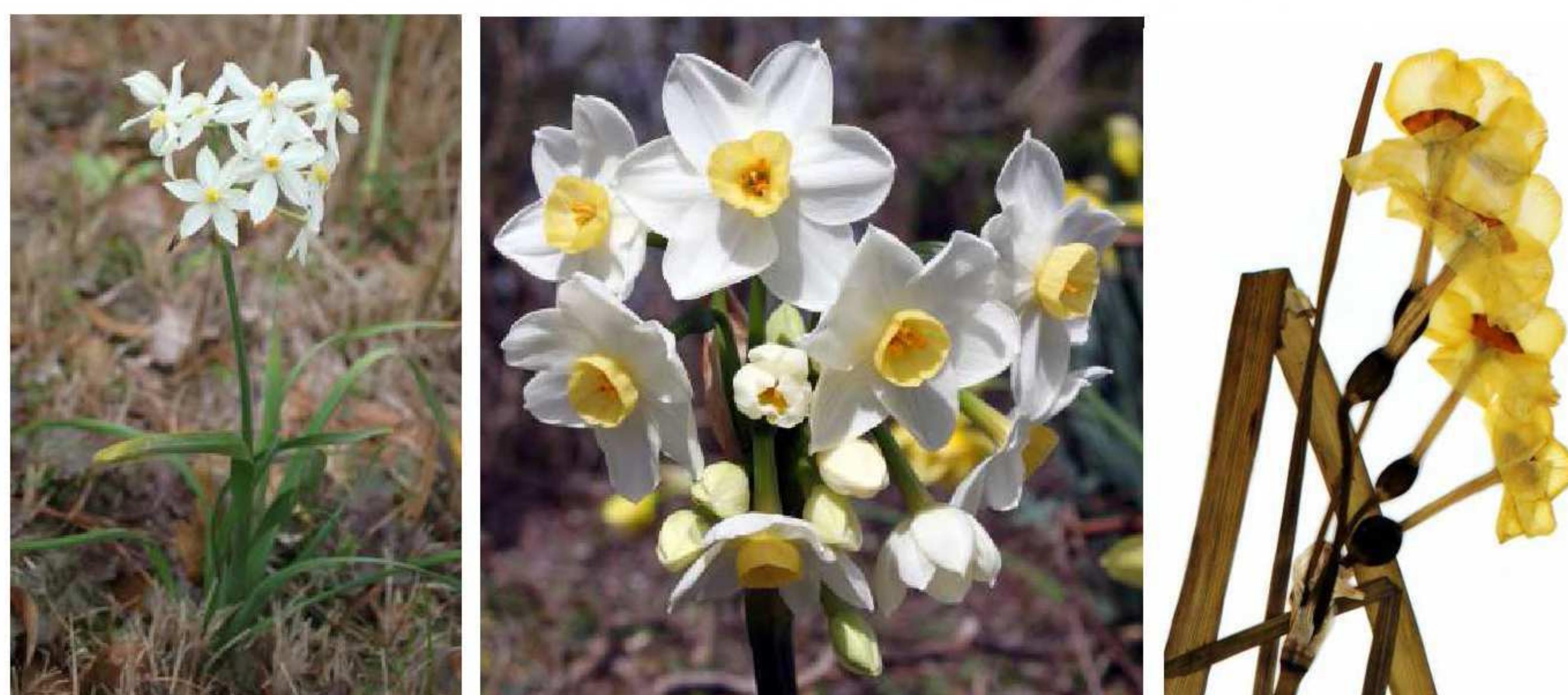
(a) White tepal form

recognized three subspecies of N. tazetta in Europe: subsp. tazetta has pure white tepals; subsp. italicus (Ker-Gawler) Baker has cream colored tepals; and subsp. aureus (Loiseleur) Baker has golden yellow tepals with an orange corona. Individuals with white tepals are the most common form of this species in the South. It is sometimes difficult to distinguish white tepal forms of N. tazetta from N. papyraceus when dried because the colored corona of N. tazetta can fade. Some previous authors have considered the two species synonymous because of their similarity on herbarium sheets (Straley & Utech. 2002). Fresh specimens of N. tazetta are easily separated by the distinct yellow corona, which contrasts with the lighter tepals. The white tepal form can also be confused with Narcissus × medioluteus , but N. tazetta typically has more than three flowers per stalk and lacks any yellow coloration at the base of their tepals. The yellow tepal form of Narcissus tazetta has recently been documented from Alabama and is reported to occur in other southeastern states. This color form can be confused with N. × intermedius , but N. tazetta has completely flat leaves. [MS]